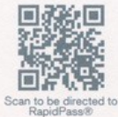
Scan to be directed to RapidPass®

Rapid Pass-help save lives in less time! Learn more at RedCrossBlood.org/RapidPass